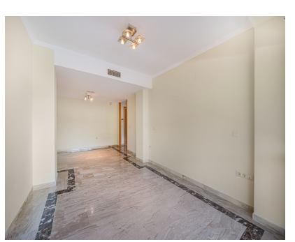
Ref.-ID: MIBGR4361284 Marbella