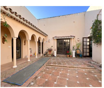
Ref.-ID: MIBGR4597402 Estepona House