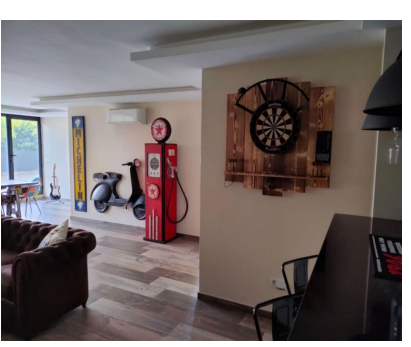
Ref.-ID: MIBGR4678282 Torremolinos