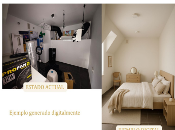
Ejemplo generado digitalmente