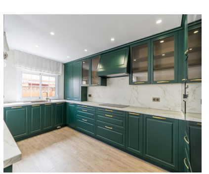
Ref.-ID: MIBGR3955450 Fuengirola