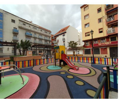
Ref.-ID: MIBGR4029592 Fuengirola Commercial