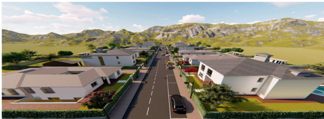
Ejemplo de barrio, zona este