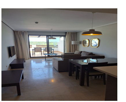
Ref.-ID: MIBGR4278859 Estepona