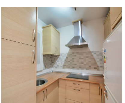
Ref.-ID: MIBGR4358761 Fuengirola

Community: 588 EUR / year Rubbish: 60 EUR / year