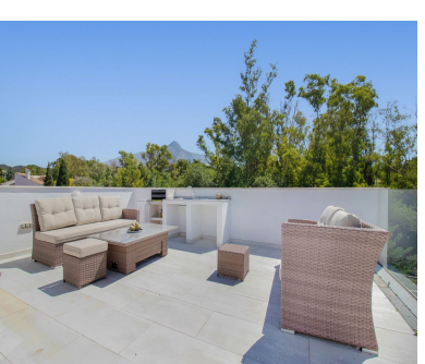
Ref.-ID: MIBGR4404076 Marbella

Community: 3,528 EUR / year IBI: 1,708 EUR / year