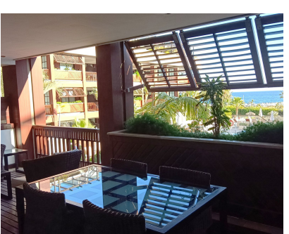
Ref.-ID: MIBGR4652524 Marbella Apartment