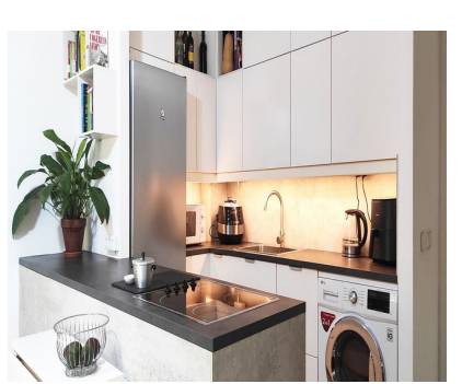
Ref.-ID: MIBGR4682245 Fuengirola

Community: 504 EUR / year IBI: 168 EUR / year