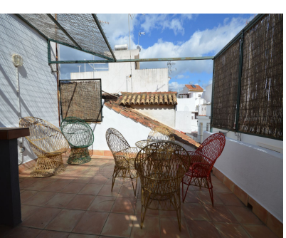
Ref.-ID: MIBGR4690876 Marbella