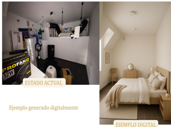
Ejemplo generado digitalmente

www.mibgroup.es +34 662 58 96 58 info@mibgroup.es