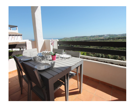
Casares Playa Apartment