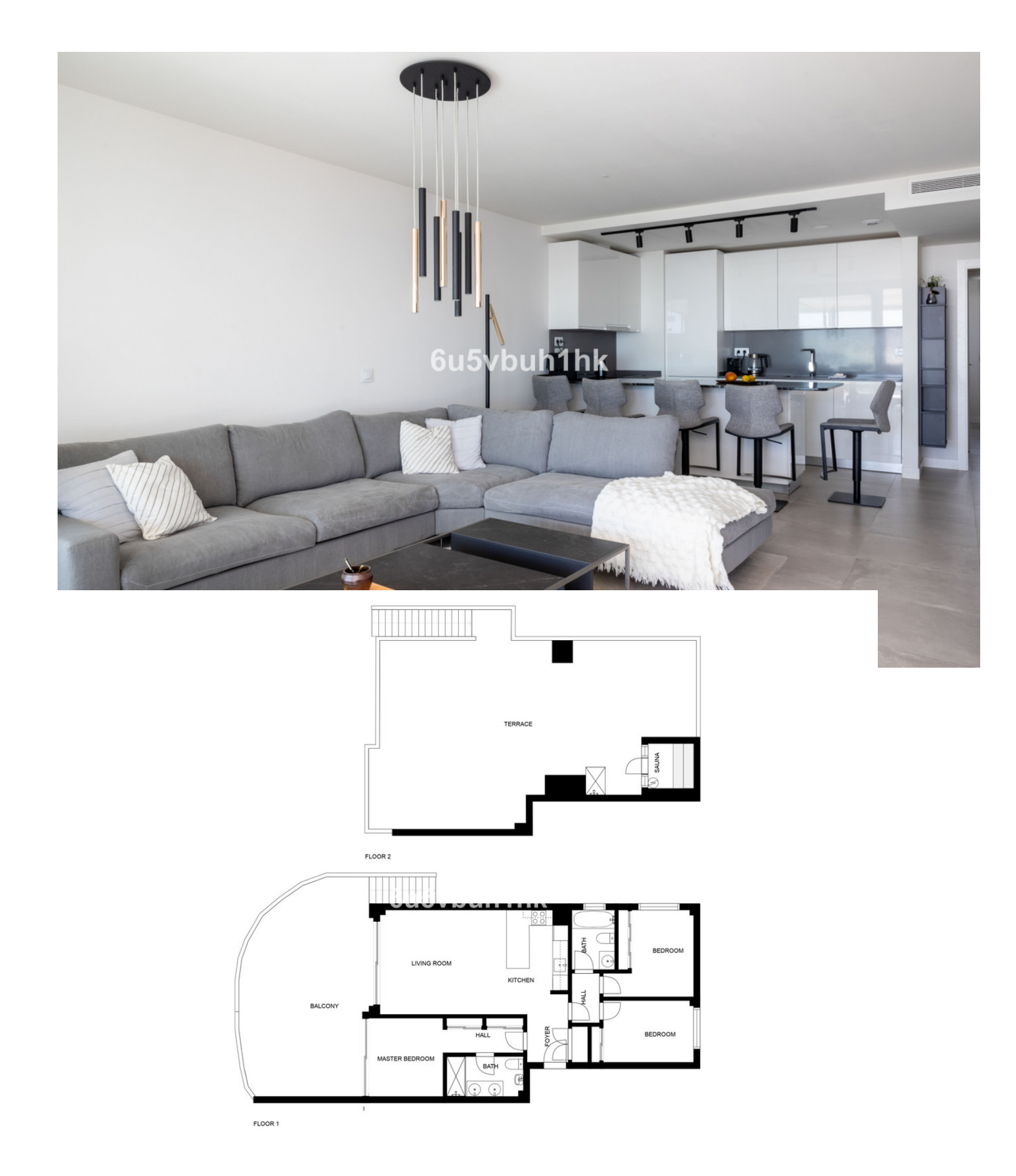
SIZES AND DIMENSIONS ARE APPROXIMATE, ACTUAL MAY VARY.