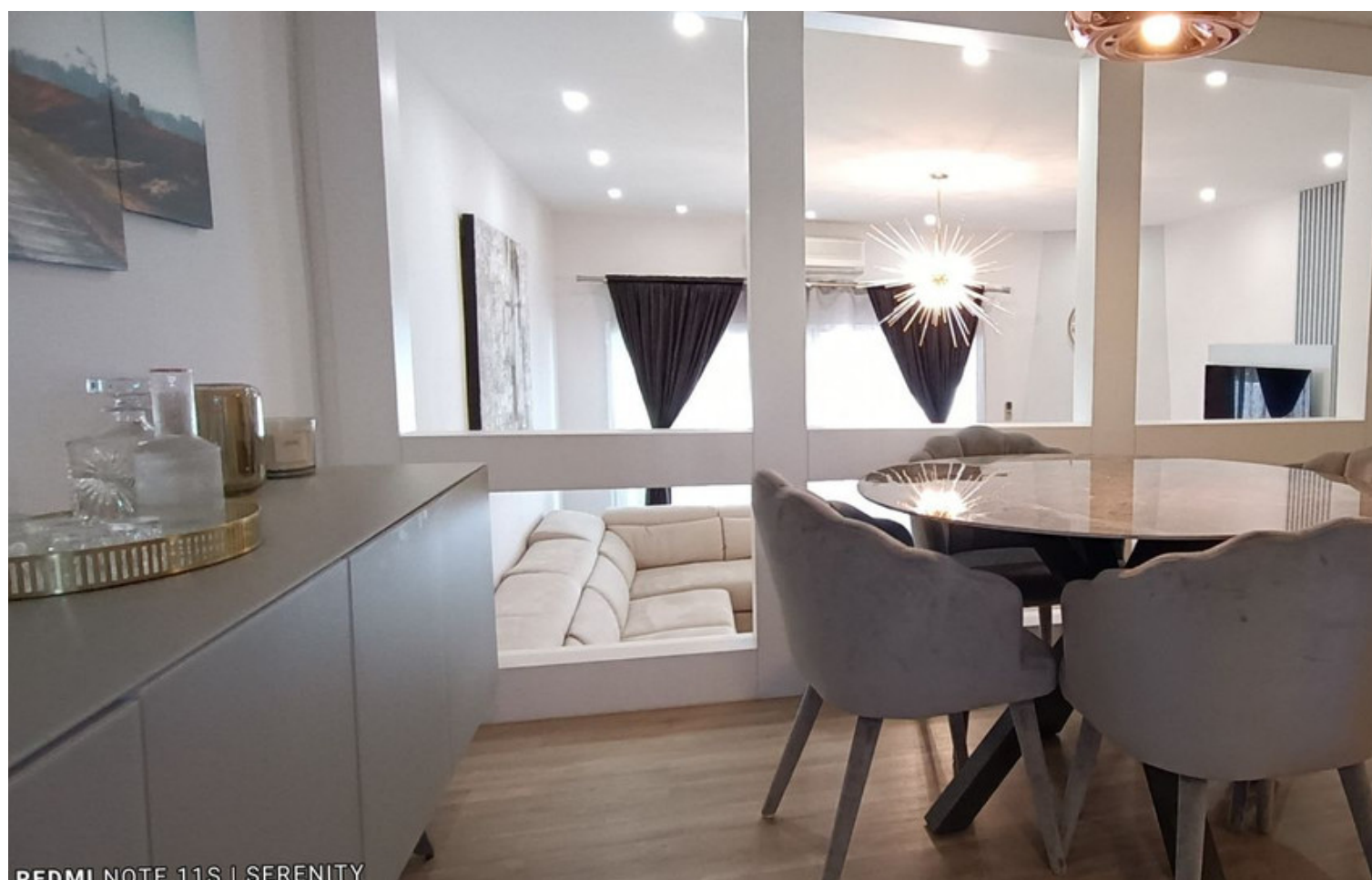
REDMI NOTE 11S | SERENITY