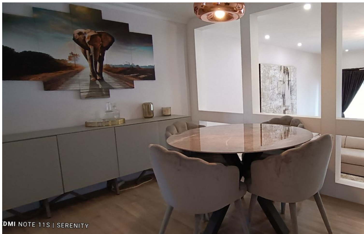
REDMI NOTE 11S | SERENITY