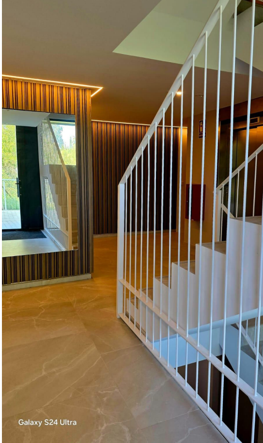
Galaxy S24 Ultra