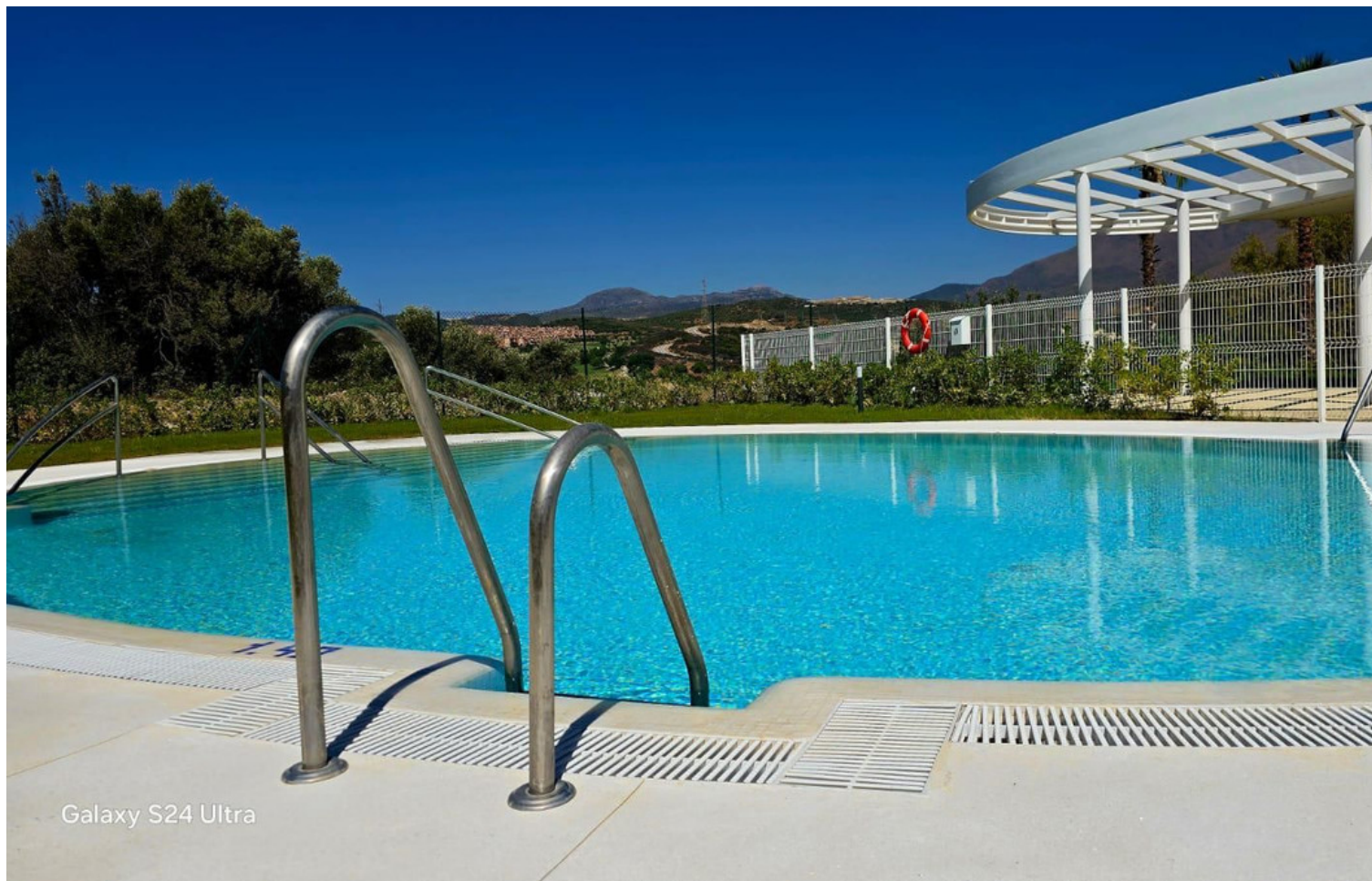
Galaxy S24 Ultra