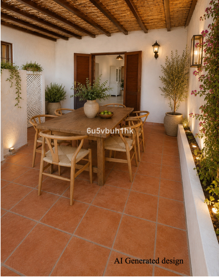
AI Generated design