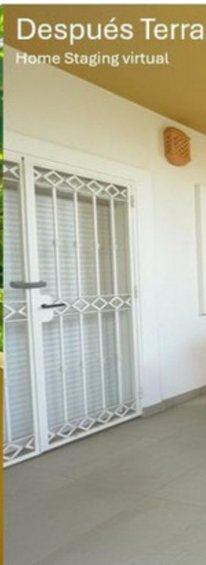
Home Staging virtual