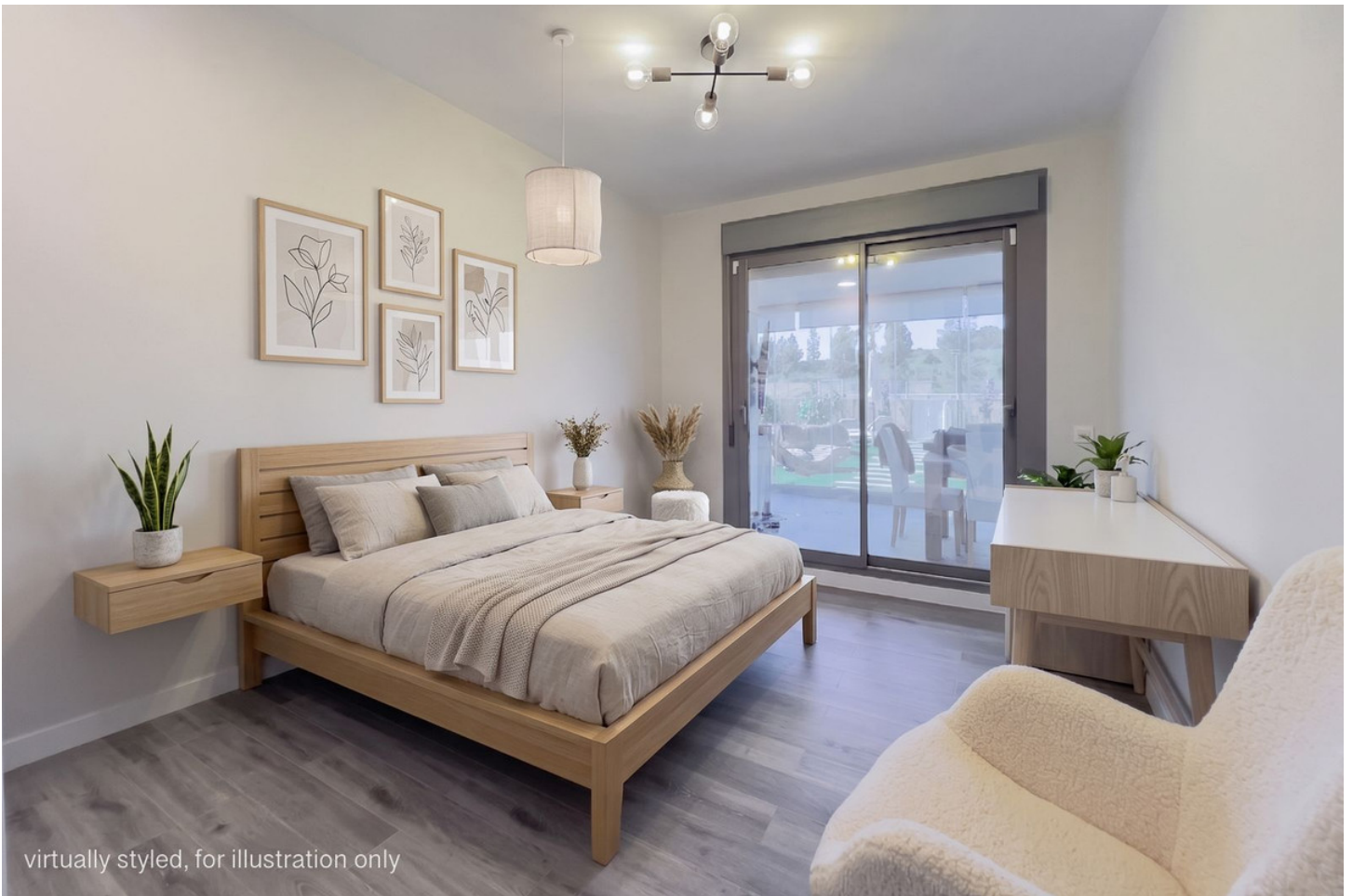
virtually styled, for illustration only