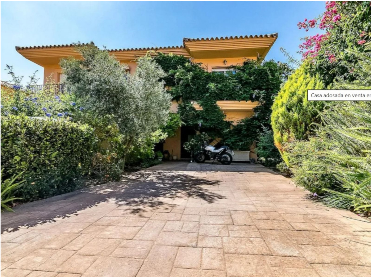
Casa adosada en venta er