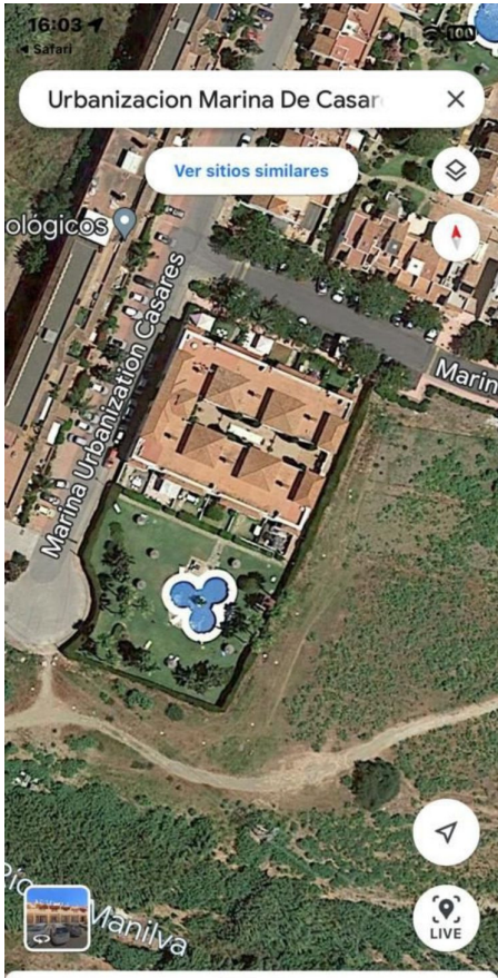
Urbanizacion Marina De Casares Suite