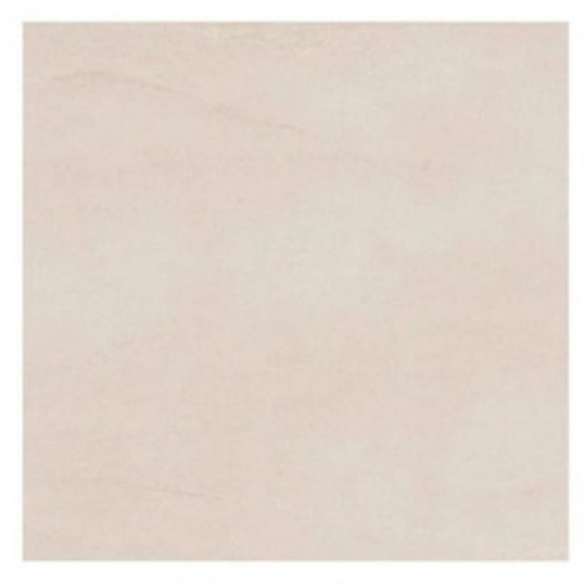
CALIZA NATURE CALIZA NATURE C-3