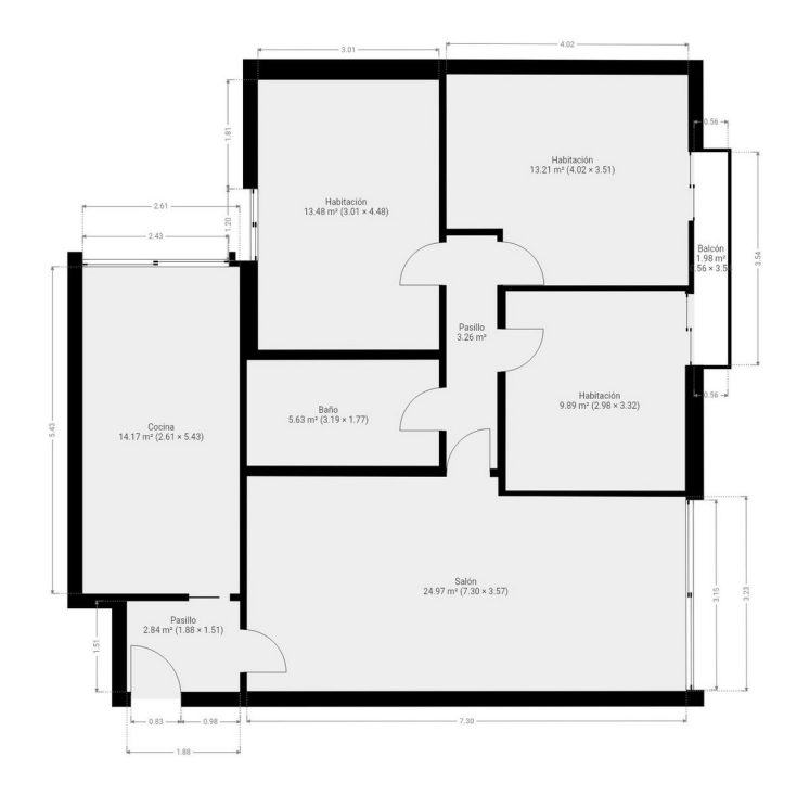
ESTE PLANO ESTA PROPORCIONADO SIN NINGUNA GARANTIA, SENSOPIA NO OFRECE NINGUNA GARANTIA, INCLUYENDO, SIN LIMITACION, GARANTIAS SOBRE LA SATISFACCION Y LA PRECISION DE LAS DIMENSIONES.