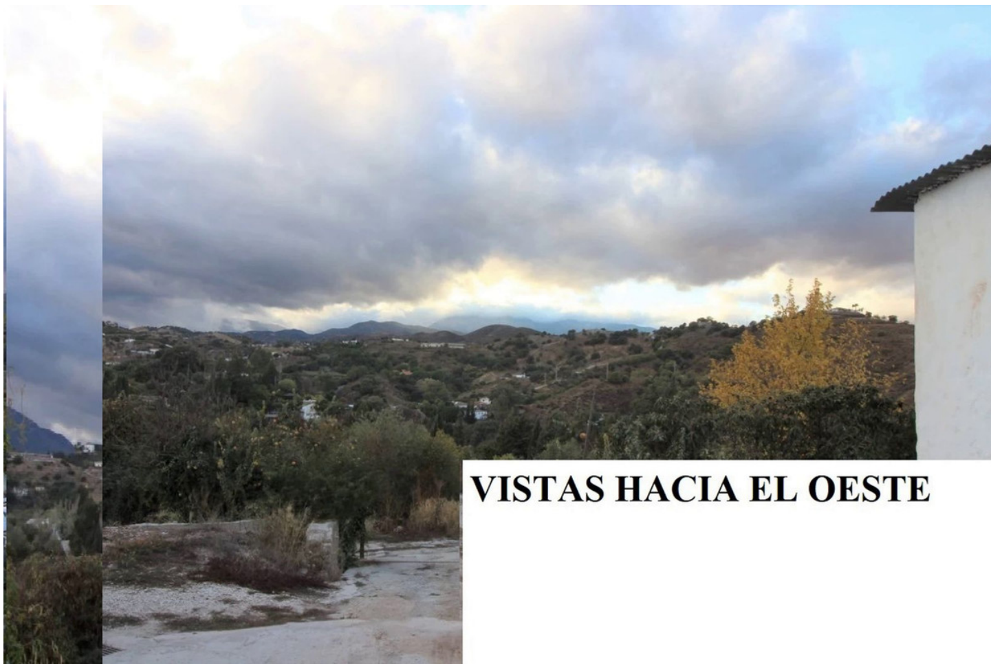
VISTAS HACIA EL OESTE