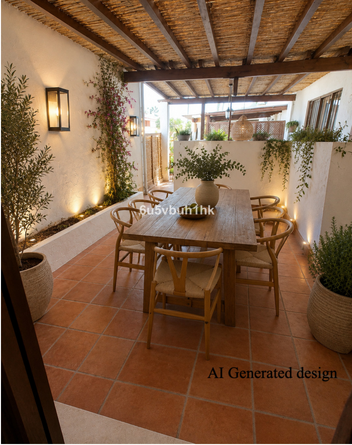
AI Generated design