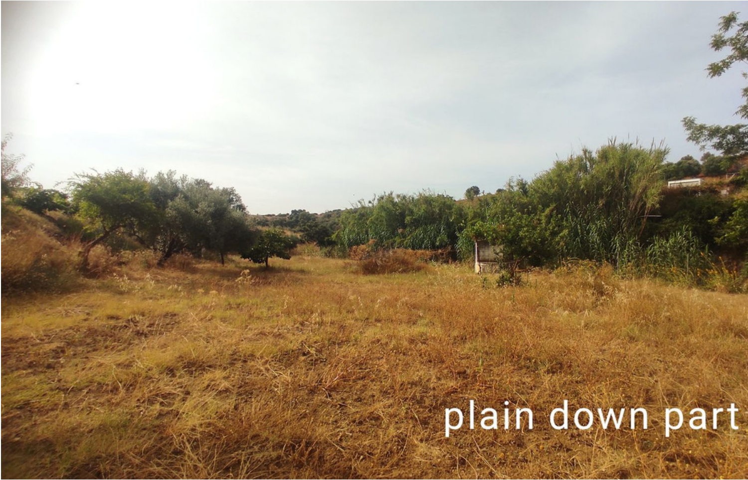
plain down part