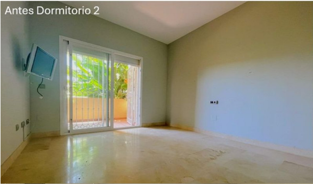
Antes Dormitorio 2