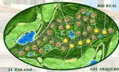
SITUATION OF BLOCKS

DAMA DE NOCHE EL PARAISO VISTA HERMOSA LOS NARANJOS RIO REAL LOS ARQUEROS LA DUQUESA