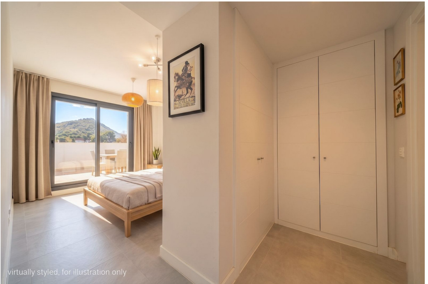
virtually styled, for illustration only