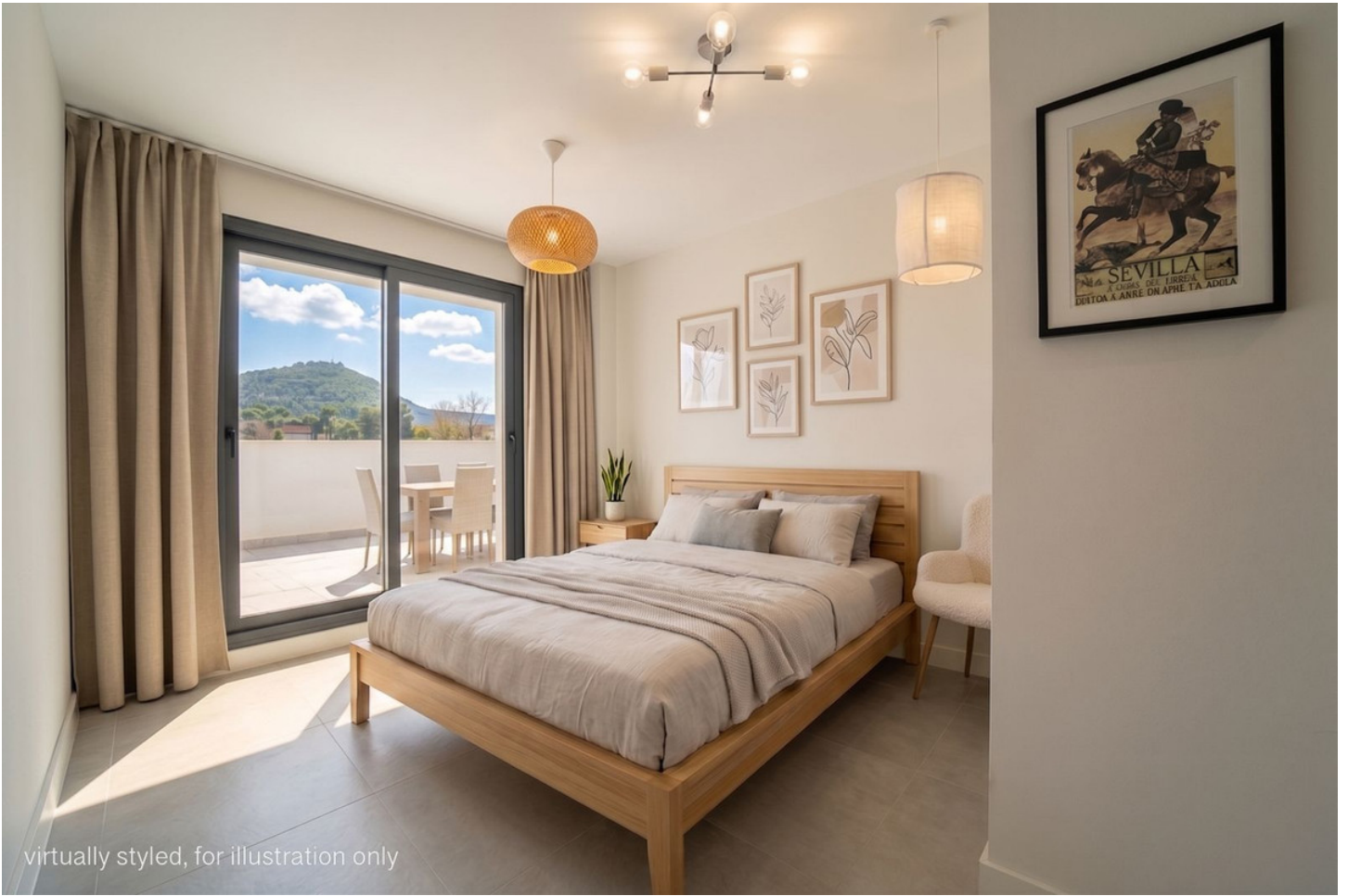
virtually styled, for illustration only