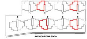
AVENIDA REINA SOFIA