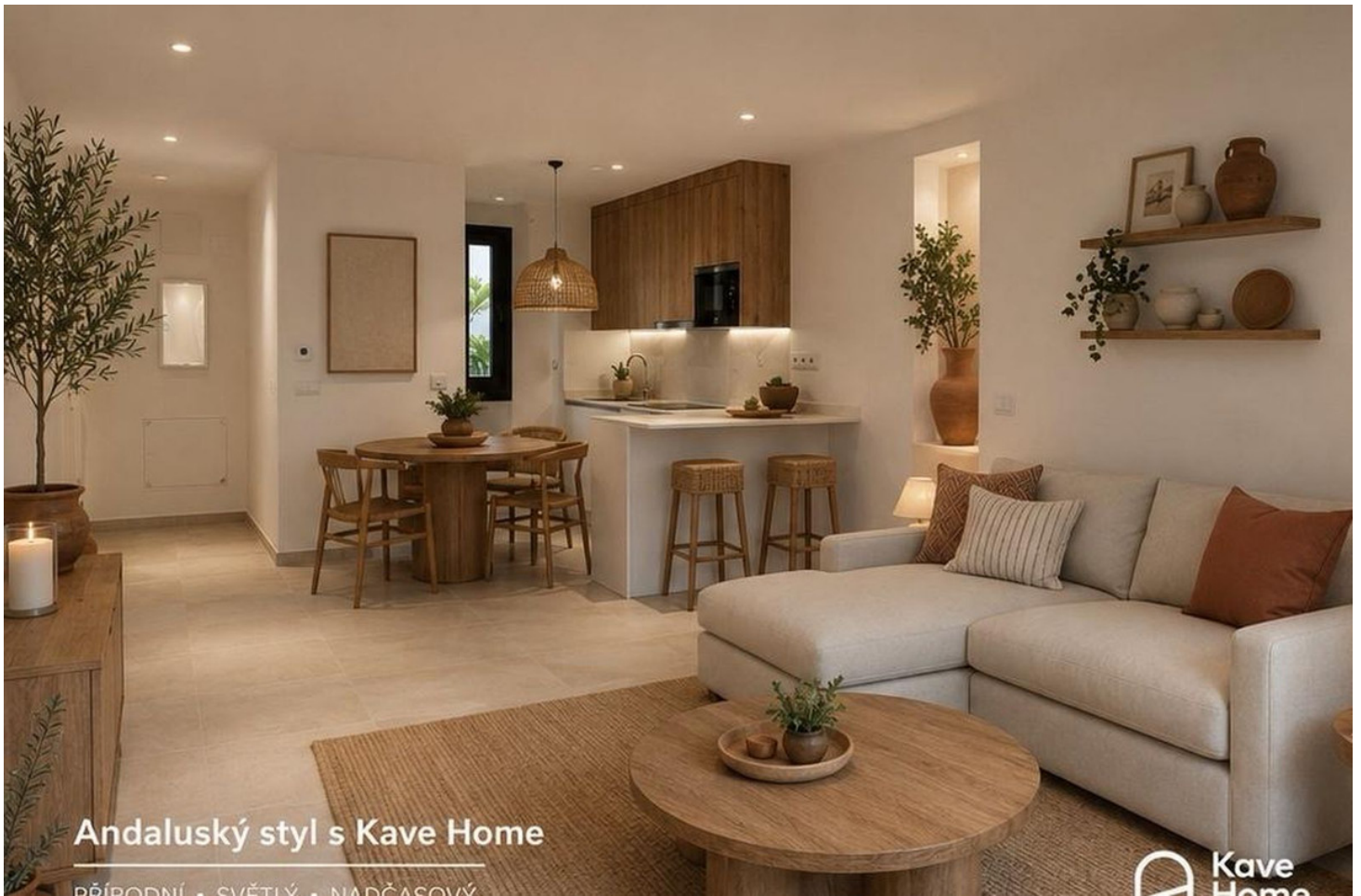
Andaluský styl s Kave Home