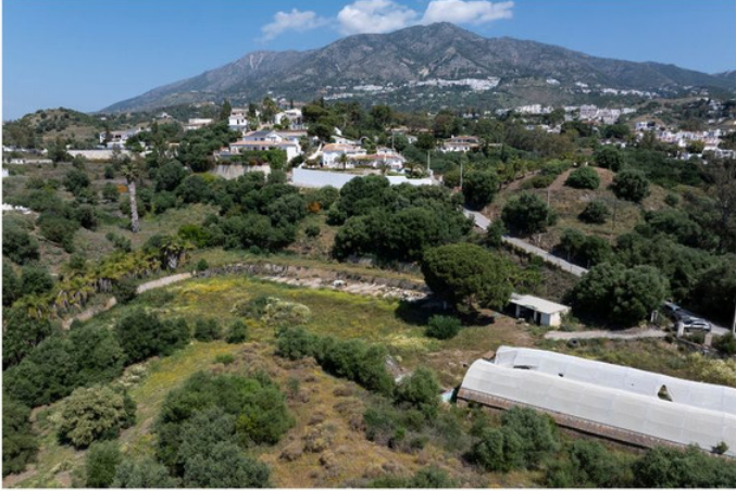
PARCELA CON PROYECTO