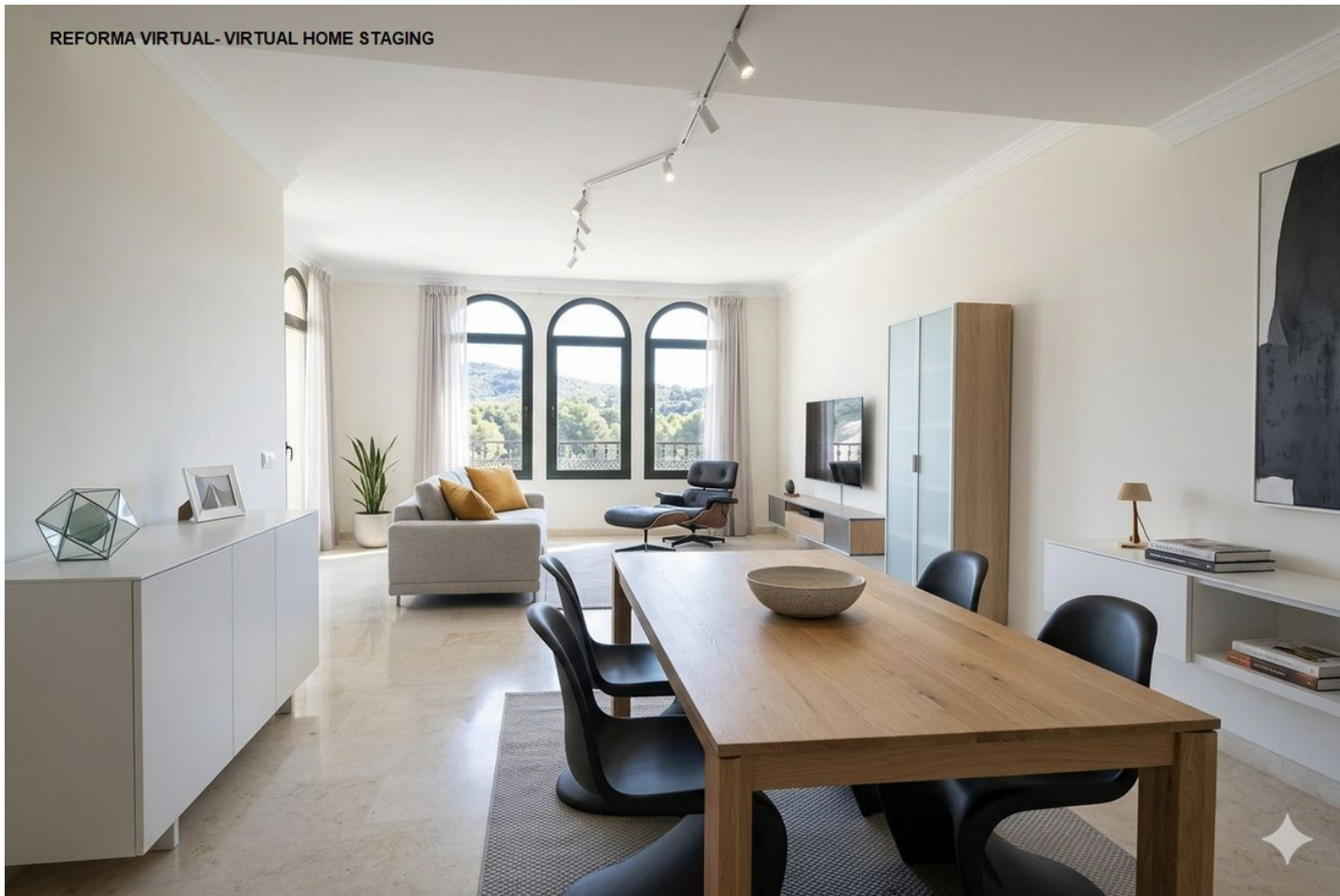
REFORMA VIRTUAL - VIRTUAL HOME STAGING