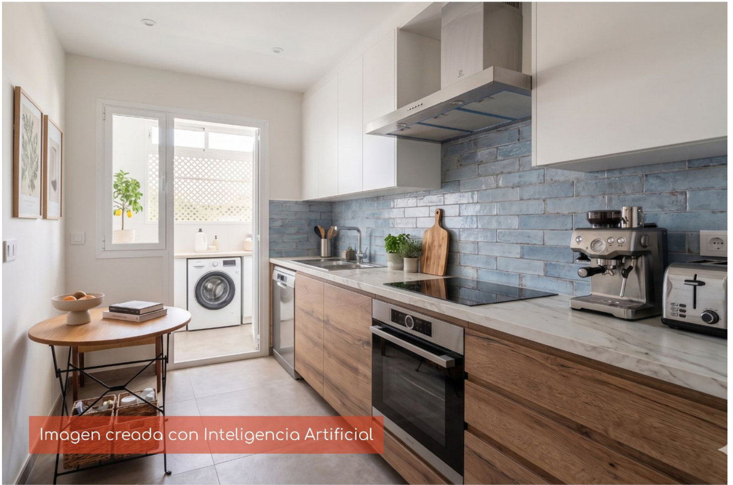
Imagen creada con Inteligencia Artificial