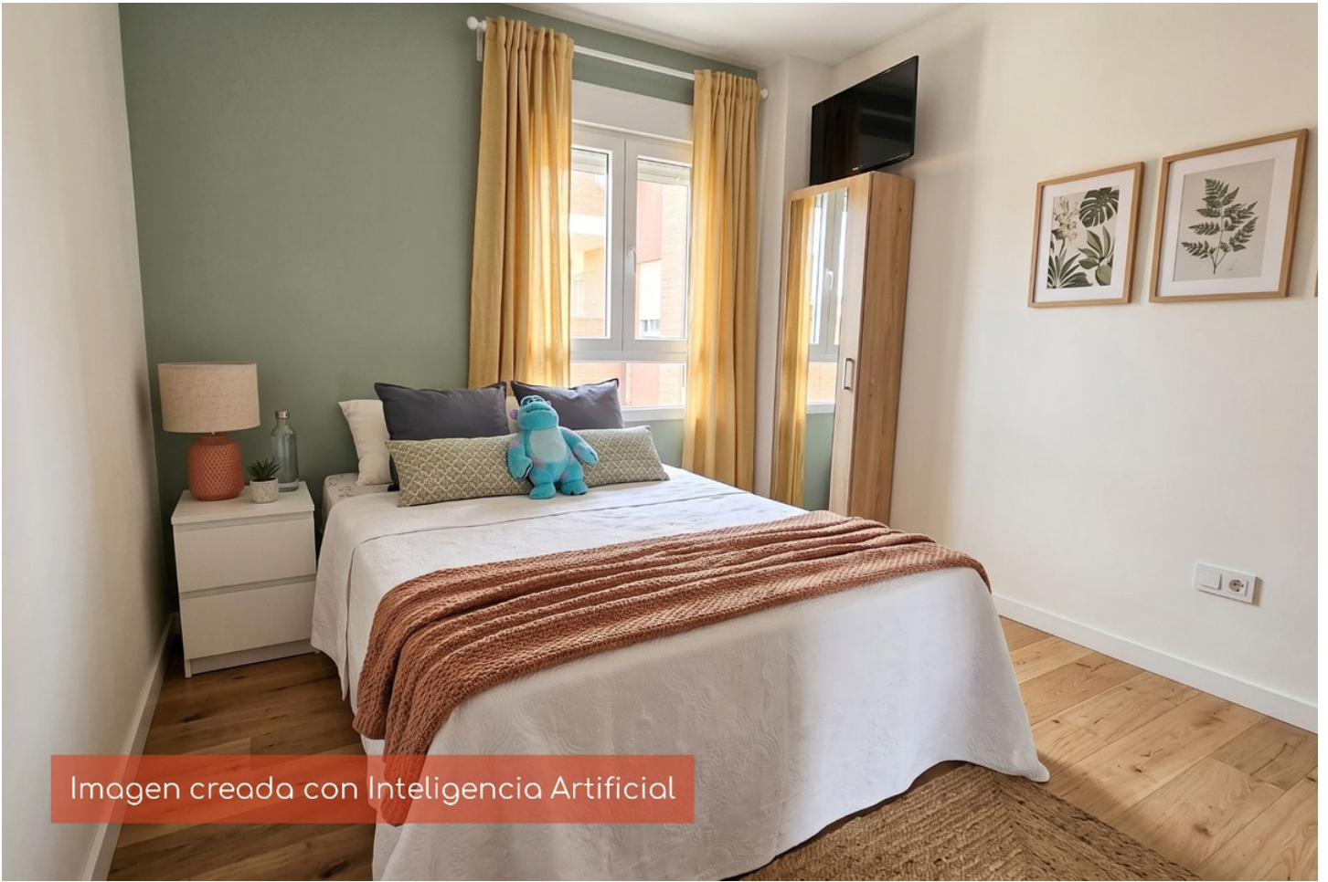
Imagen creada con Inteligencia Artificial