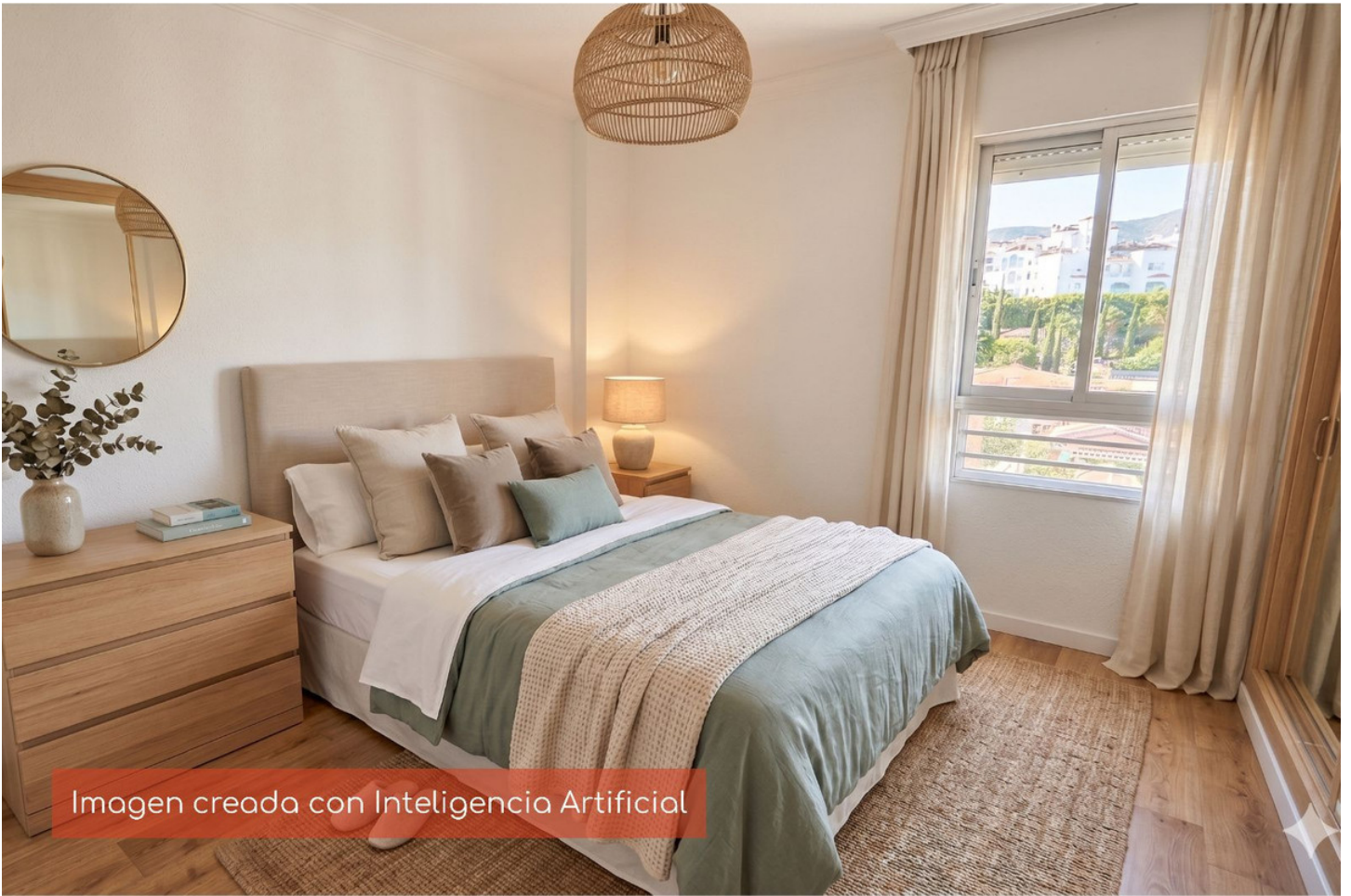
Imagen creada con Inteligencia Artificial