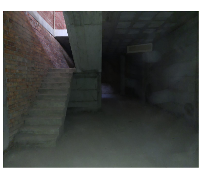
Ref.-ID: MIBGR4453921 Fuengirola Коммерческая