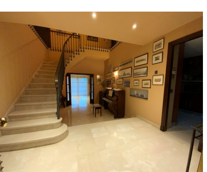
Ref.-ID: MIBGR4191364 Marbella

ИБИ: 2,500 EUR / год Mycop: 180 EUR / год