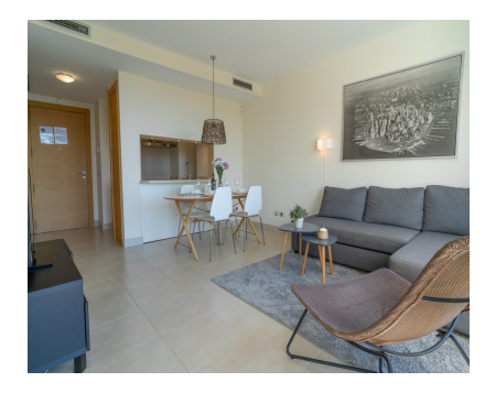
Коммунальные: 3,024 EUR /