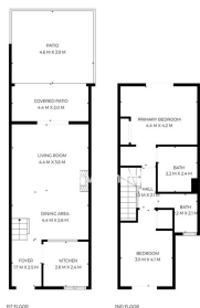
SEE AREA APPROXIMATE, ACTUAL MAY VARY