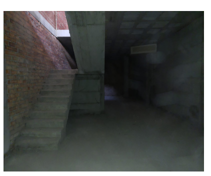
Ref.-ID: MIBGR4453921 Fuengirola Коммерческая