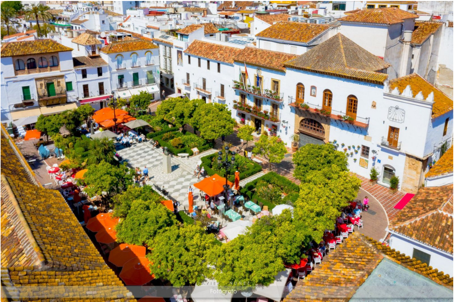
DAVIER NÚÑEZ Fotógrafo