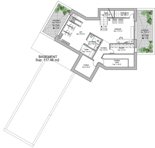
ARTOLA BAJA, CALLE DE LOS OLIVOS, PARCELA Nº 50 BASEMENT ESC. 1:100 MARCH 2021