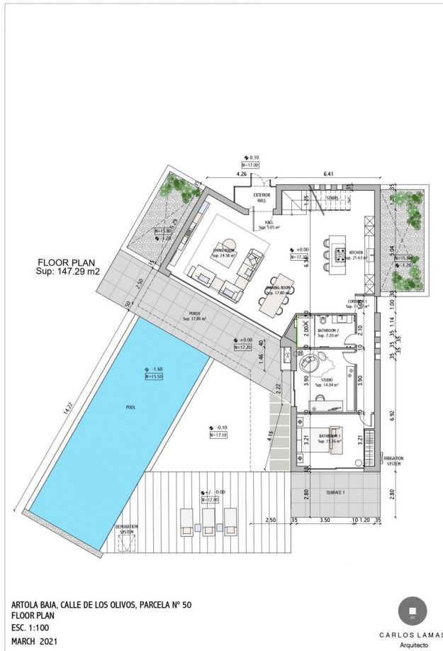
ARTOLA BAJA, CALLE DE LOS OLIVOS, PARCELA Nº 50 FLOOR PLAN ESC. 1:100 MARCH 2021