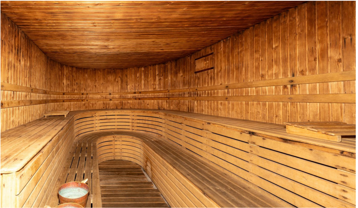
EDIF. MARBELLA HOUSE. ATICO 101. 18/01/2022