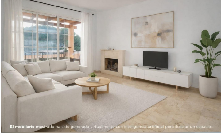
El mobiliario mostrado ha sido generado virtualmente con inteligencia artificial para ilustrar un espacio.