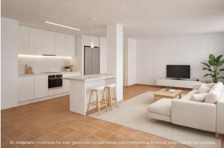
El mobiliario mostrado ha sido generado virtualmente con inteligencia artificial para ilustrar un espacio.