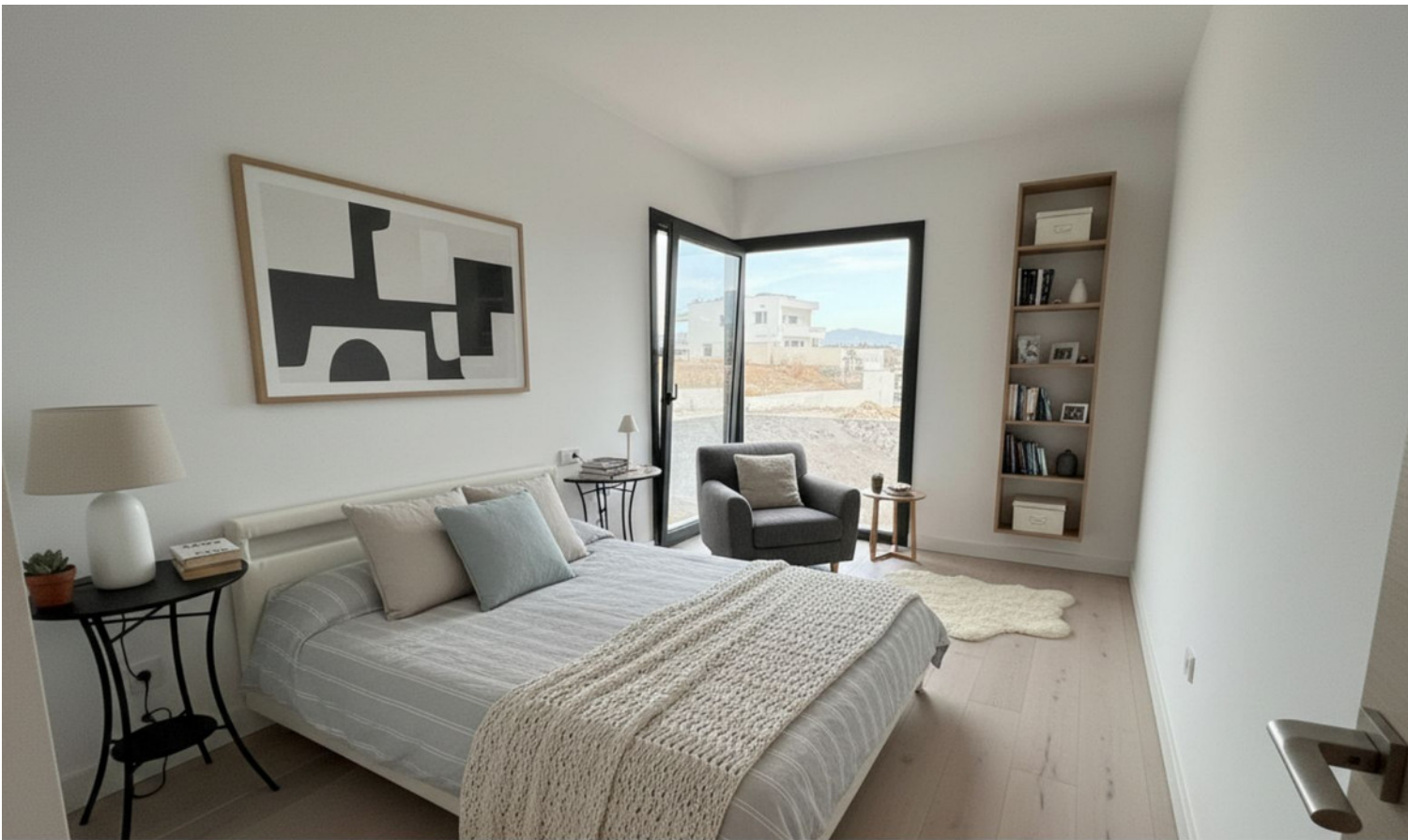
This is a visualization, furniture has been added