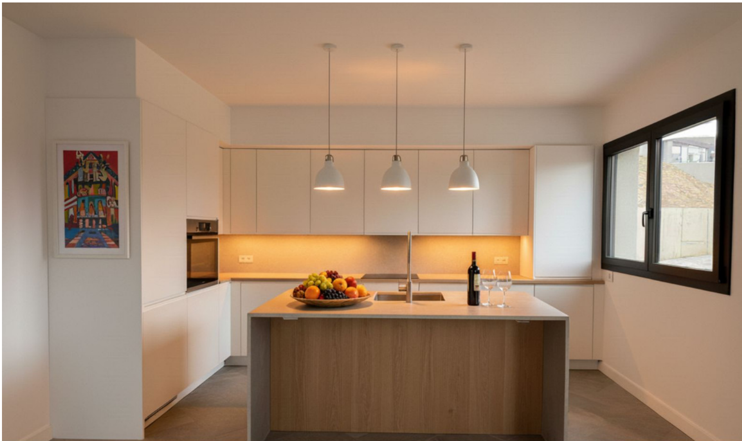
This is a visualization