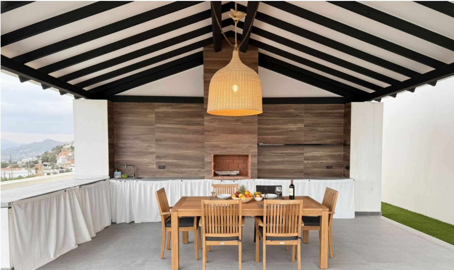
This is a visualization