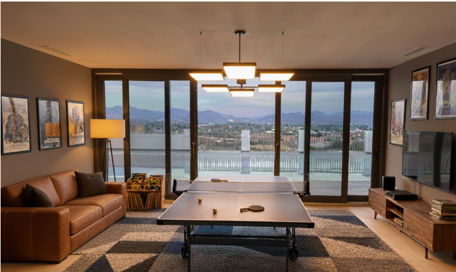
This is a visualization, furniture has been added