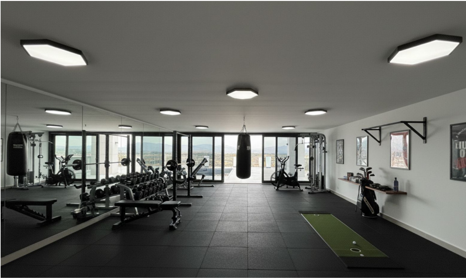
This is a visualization