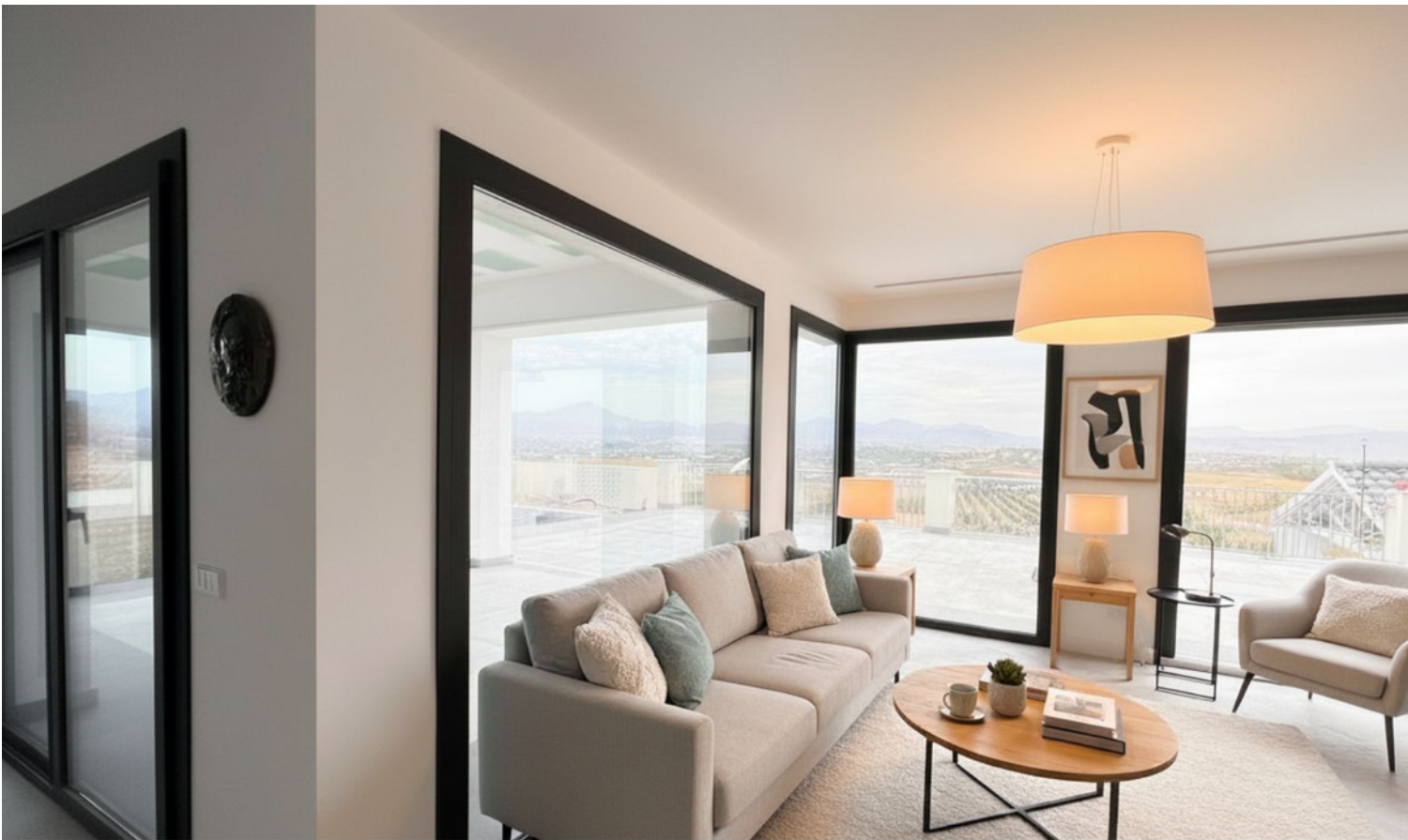
This is a visualization, furniture has been added