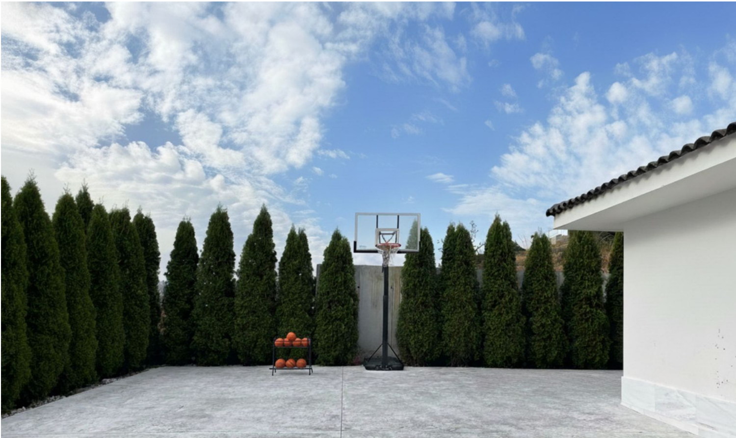
This is a visualization, plantings have been added