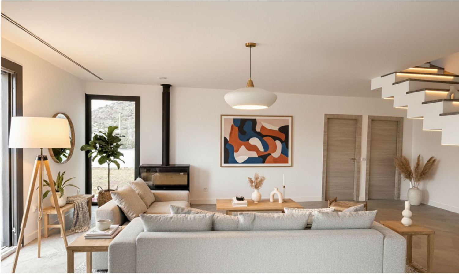
This is a visualization, furniture has been added