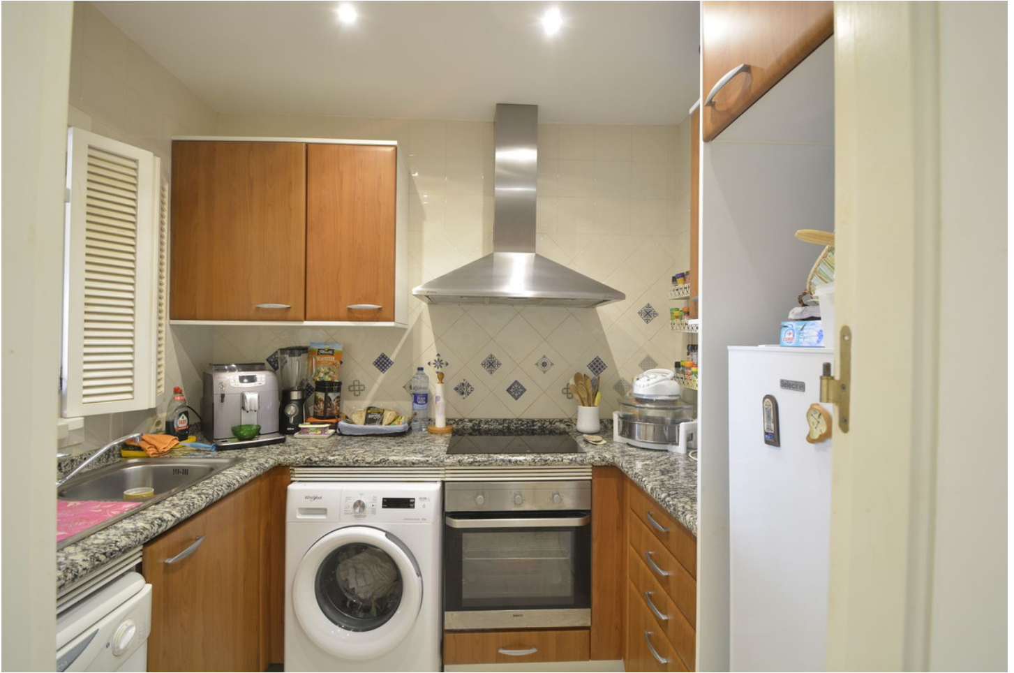
REFORMA VIRTUAL- VIRTUAL HOME STAGING