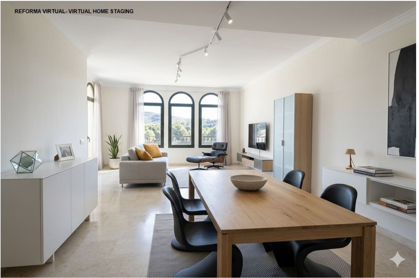
REFORMA VIRTUAL - VIRTUAL HOME STAGING