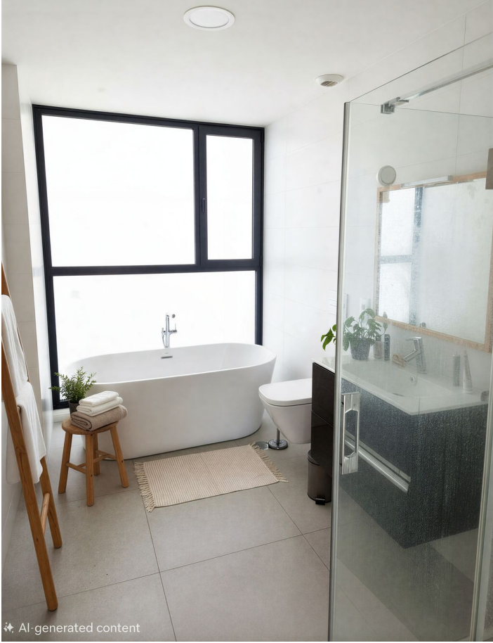
✦ AI-generated content